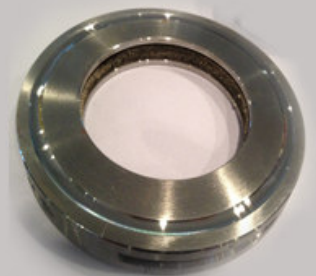
THE FRONT ROLLER BRACKET PATENT NUMBER G 8507967.7